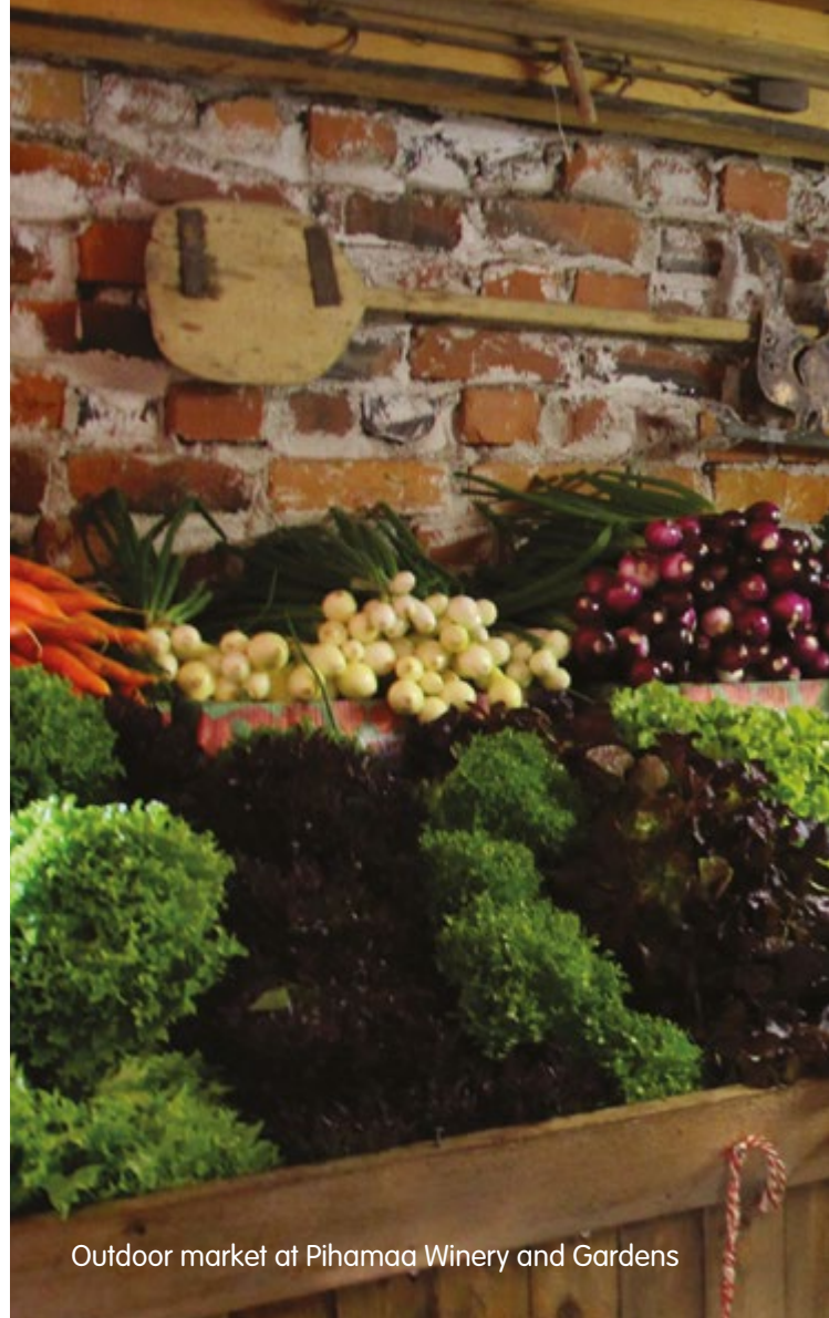
Outdoor market at Pihamaa Winery and Gardens

The villagers founded a co-operative dairy in 1928. The dairy closed in 1971. The building has now been converted into the Lomameijeri Dairy, an events venue available for private hire. Holiday cottages on the grounds are also available. Owned by the Tuottajain Maito co-operative.